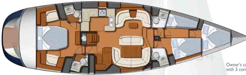
Owner's cabin aft with 3 convertible cabins forward