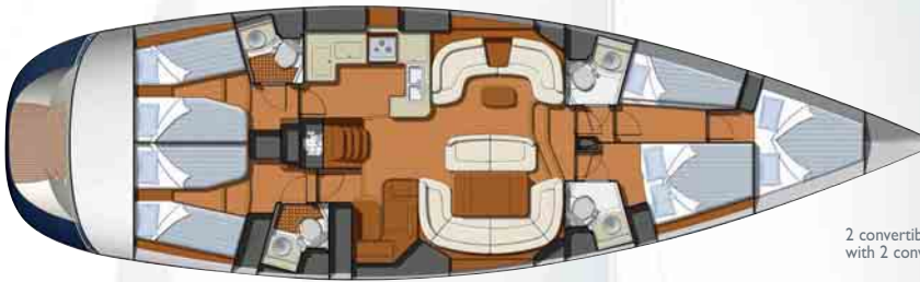
2 convertible cabins aft with 2 convertible cabins forward